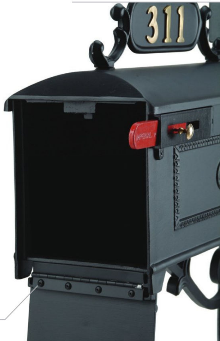
INSTALLED HINGE LG