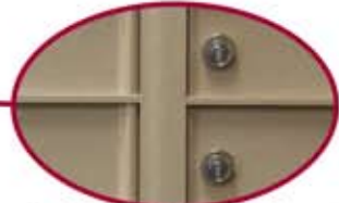
Interlocking, overlapping seams and tight clearances to prevent prying