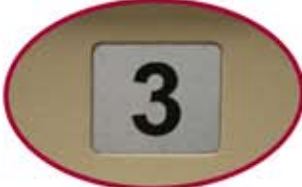
Standard silver adhesive identification decals contain up to five characters (engraving optional)