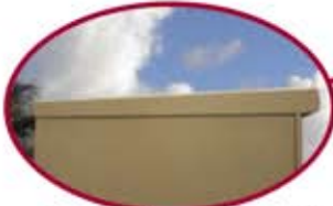
Sloped top for moisture runoff