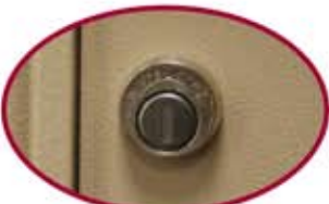
Heavy-duty tenant cam lock with three keys