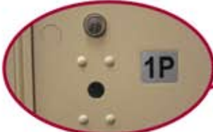
Fully Integrated parcel locker(s) with key trapping lock