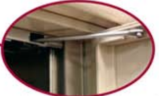
Stainless steel hold open door catch on each side of master gate