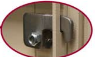
Heavy duty cam latches through frame for added security