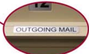
Integrated Outgoing Mail Slot with weather protection hood