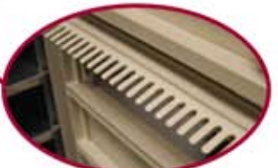
Aluminum comb prevents mail fishing in outgoing mail collection compartment