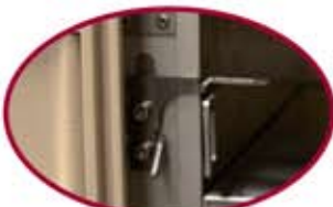
Easy release handle to open master gate