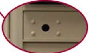
Convenient solid aluminum integrated outgoing mail collection compartment prepped for USPS Arrow Lock