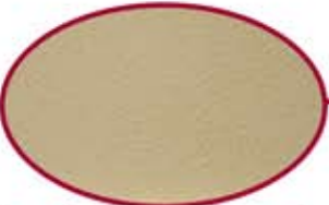
Rugged, weather-resistant powder coat finish in four architectural colors