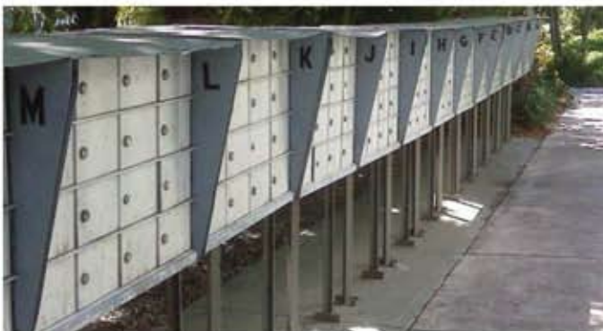
Obsolete NDCBUs are no longer permitted for replacement or new installations.

installation, or create a standalone package center. Florence is proud to be the only USPS Approved manufacturer of the OPL, ensuring the Postal Service can always deliver the packages you or your customers are waiting for the very first time! (see page 8 for product details)