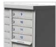
Postal Grey* (PG)