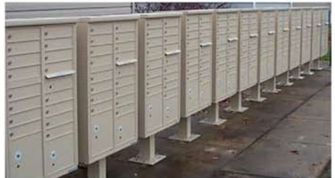
New CBUs accommodate both mail and packages while providing greater security.