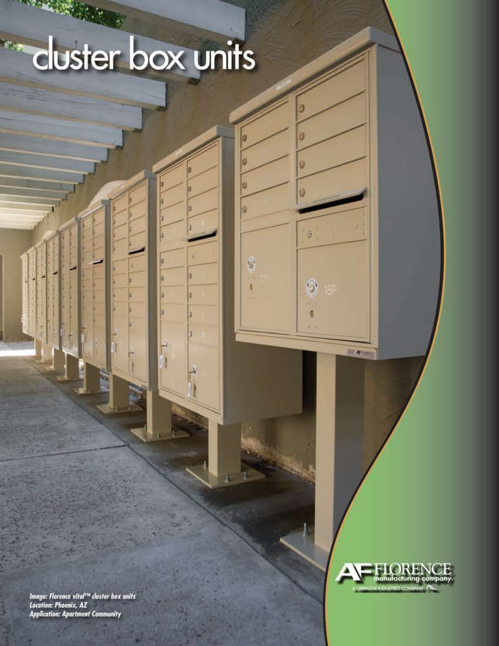
Image: Florence vital™ cluster box units Location: Phoenix, AZ Application: Apartment Community

AF FLORENCE manufacturing company A GIRARATAR INDUSTRIES COMPANY