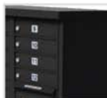
Dark Bronze (DB)