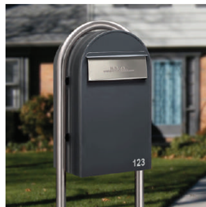
BOBI ROUND stand fits all BOBI mailboxes.