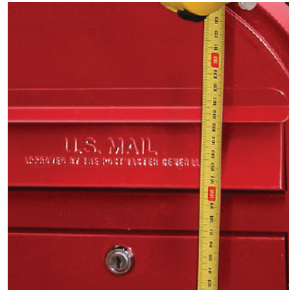
Check the height of the letterslot (41"-45" or 100-110 cm)