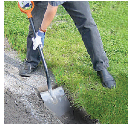
Dig ca. 20" deep mounting hole.