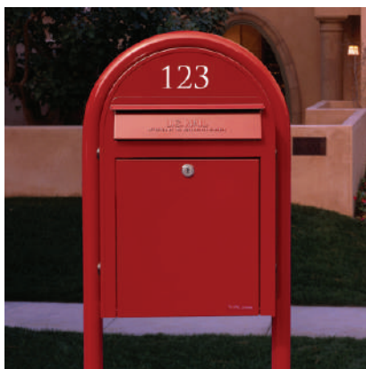
You may finish your new letterbox with name & street numbers...