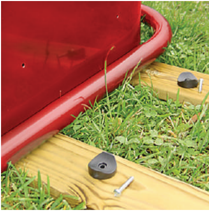
All the fittings are provided...