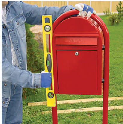
Check the level.