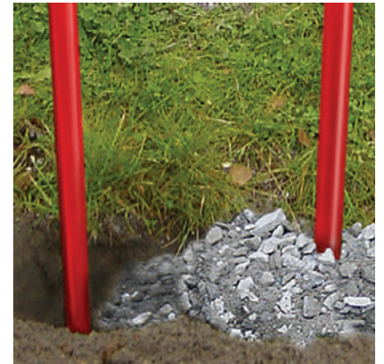
Fill the mounting hole with gravel or concrete.